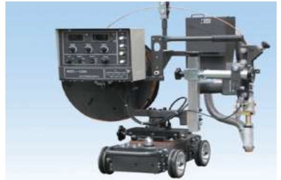
SAW For H-Beam Welding