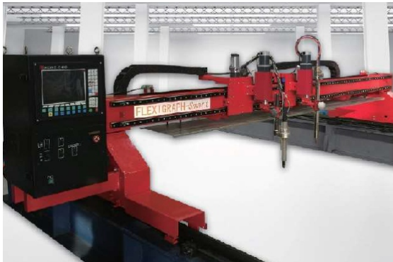
CNC Plasma BED SIZE -2.5 X 12.3 Meter